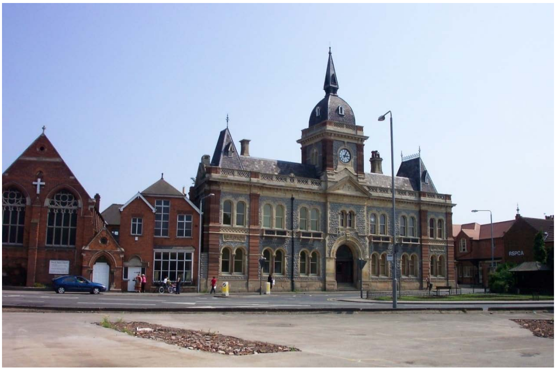
5. Newark Castle Brewery recently converted to residential accommodation. 2008

During the 18<sup>th</sup> century, throughout the 19<sup>th</sup> and until the second half of the 20<sup>th</sup> century, Newark was the centre of the English brewing and malting industries. Newark's brewing tradition has been maintained by the development of a 'Malting and Brewing Trail'. This is a short walk that takes in the buildings and sites that relate to malting and brewing. Similar trails relating to Newark's Medieval timber framed buildings, Newark's Art Deco past and the Civil War have now been developed.