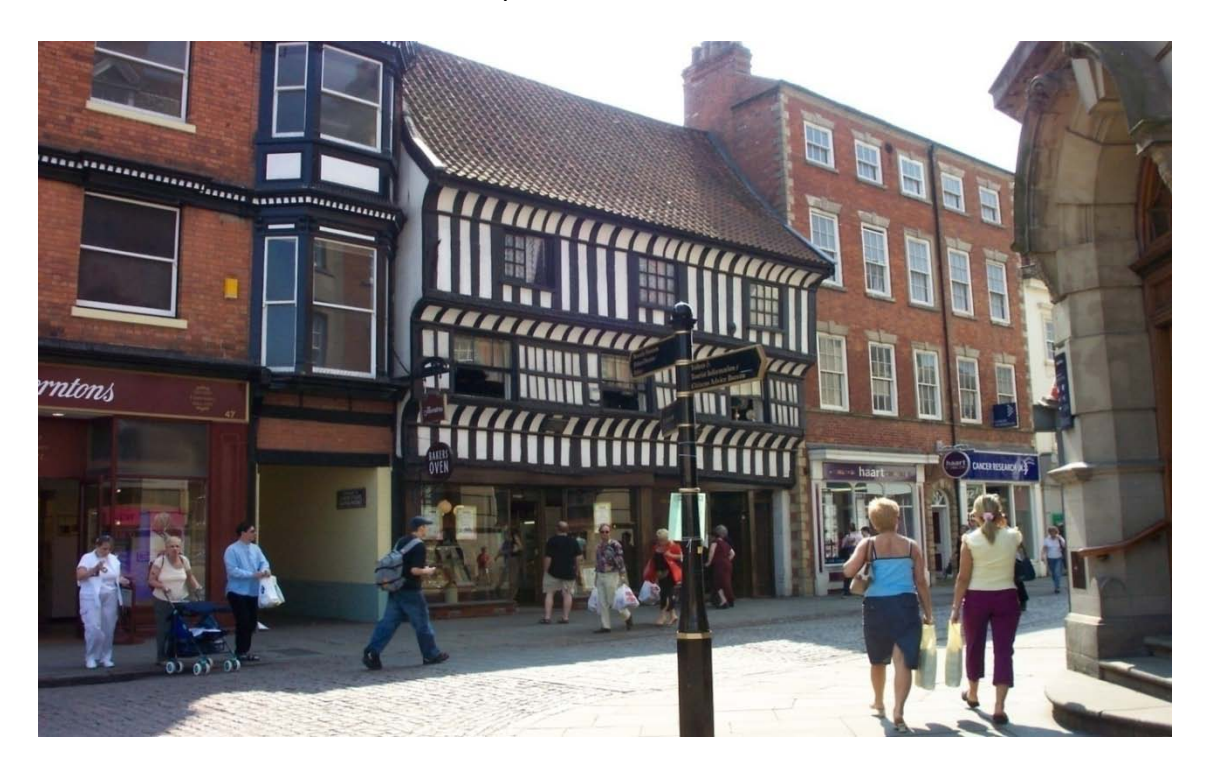
6. Historic centre of Newark. 2007

During the 18<sup>th</sup> century, throughout the 19<sup>th</sup> and until the second half of the 20<sup>th</sup> century, Newark was the centre of the English brewing and malting industries. Newark's brewing tradition has been maintained by the development of a 'Malting and Brewing Trail'. This is a short walk that takes in the buildings and sites that relate to malting and brewing. Similar trails relating to Newark's Medieval timber framed buildings, Newark's Art Deco past and the Civil War have now been developed.