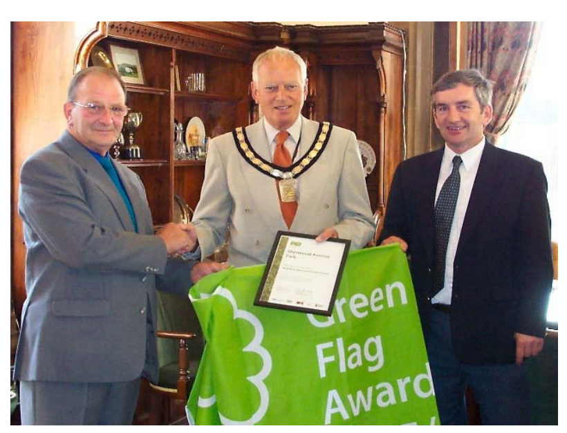
12. The presentation of a Green Flag Award to Sherwood Ave Park, Newark. 2007

Four of the large managed open spaces in Newark are recognised for their importance and management as reflected in the gaining of the national Green Flag Award. It is unusual for a town the size of Newark to obtain four of these prestigious awards.