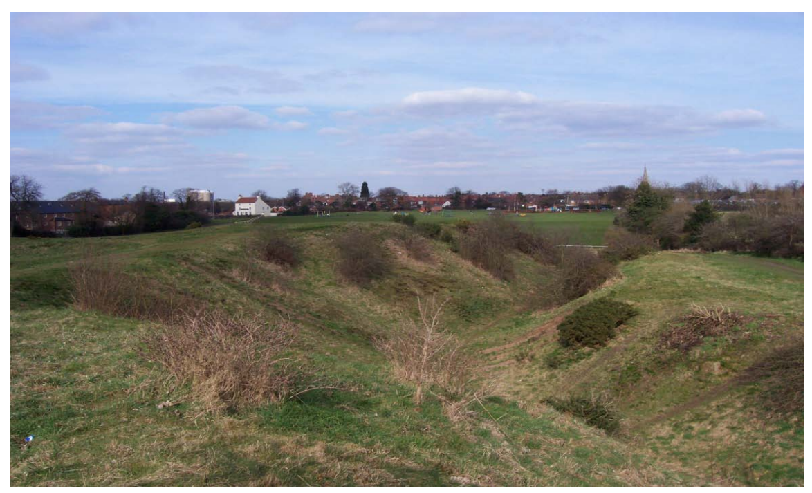
13. The Sconce Earthworks in Devon Park

A successful bid to the Great Britain National Lottery Fund has been successful for a £1.1million scheme to improve the park. The scheme will provide a visitor centre, improved access to the Sconce via a newly constructed bridge, the design of which will reflect Newark's civil war past, and improved disabled access around the park.