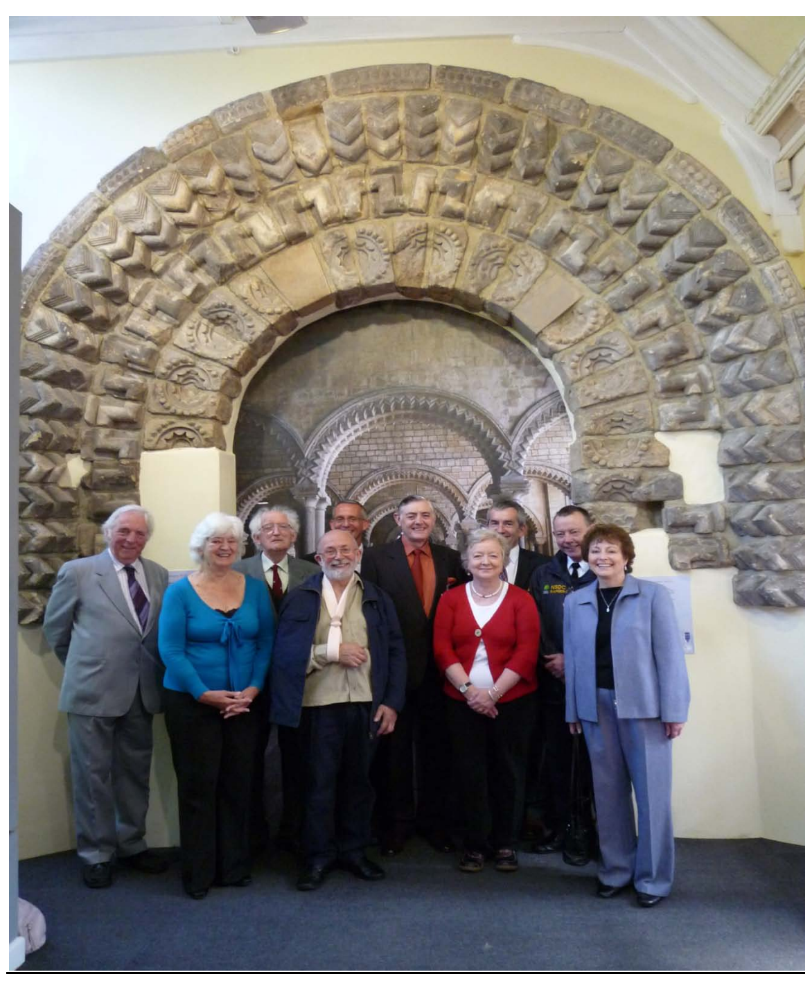
4. The Friends of Newark Castle at the opening of the Arch. 2009