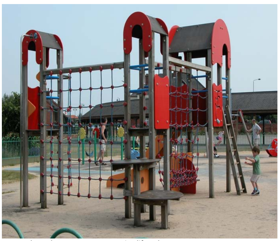
17. Outdoor play encourages an active lifestyle. 2008