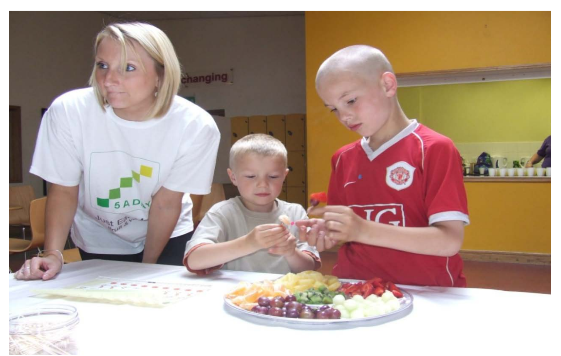
14. A Community Nutritionist working with a local group. 2008

Community based nutritionists employed in partnership with local organisations are crucial in delivering on a wide range of health agendas. The work is delivered with reference to a local delivery plan. All local actions are developed with reference to the Nottinghamshire Countywide Obesity Strategy and to the targets set out in the Nottinghamshire Local Area Agreement. The actions identified in the local delivery plan are developed through consultation.