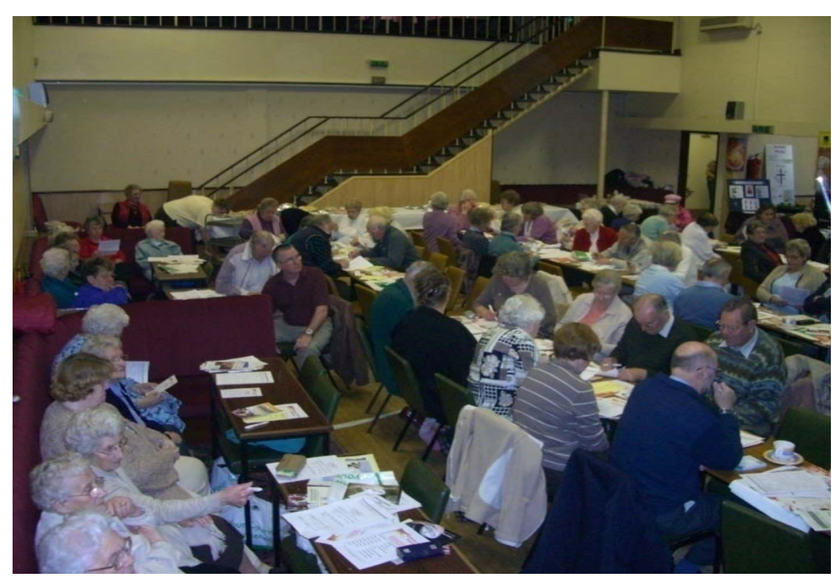
20. Older person consultation event. 2008

Residents are asked about their most important concerns including crime and anti-social behaviour. They are also asked for their opinions on facilities such as libraries, museums and galleries, theatres and concert halls, parks and open spaces, sports and leisure facilities.