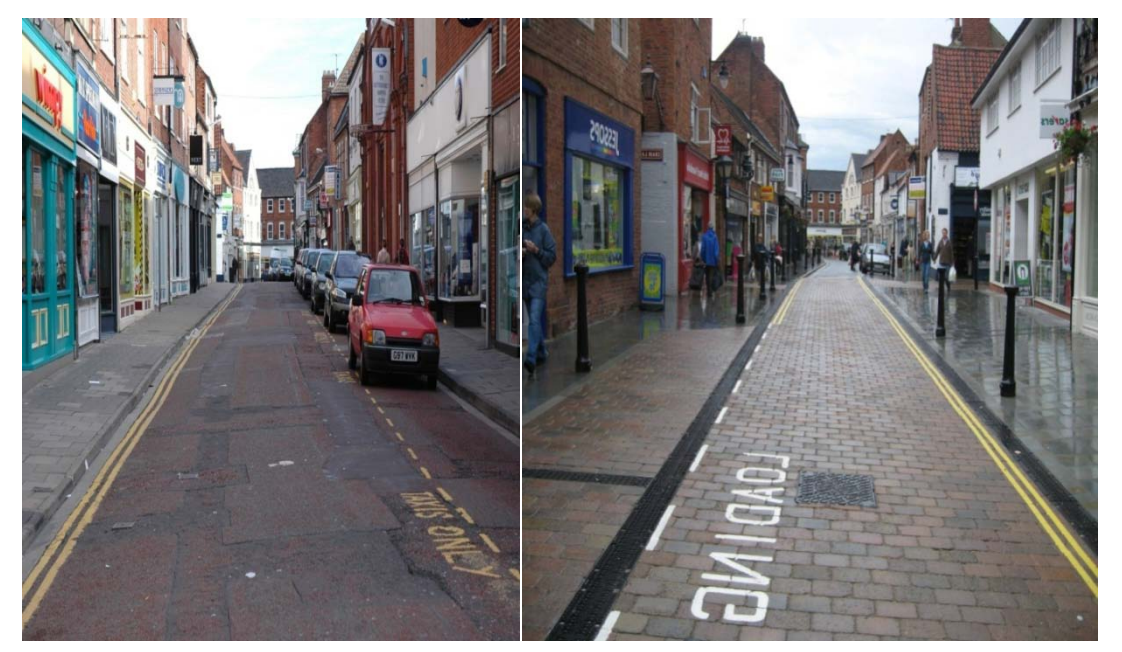
10. Middlegate prior to work. 2007