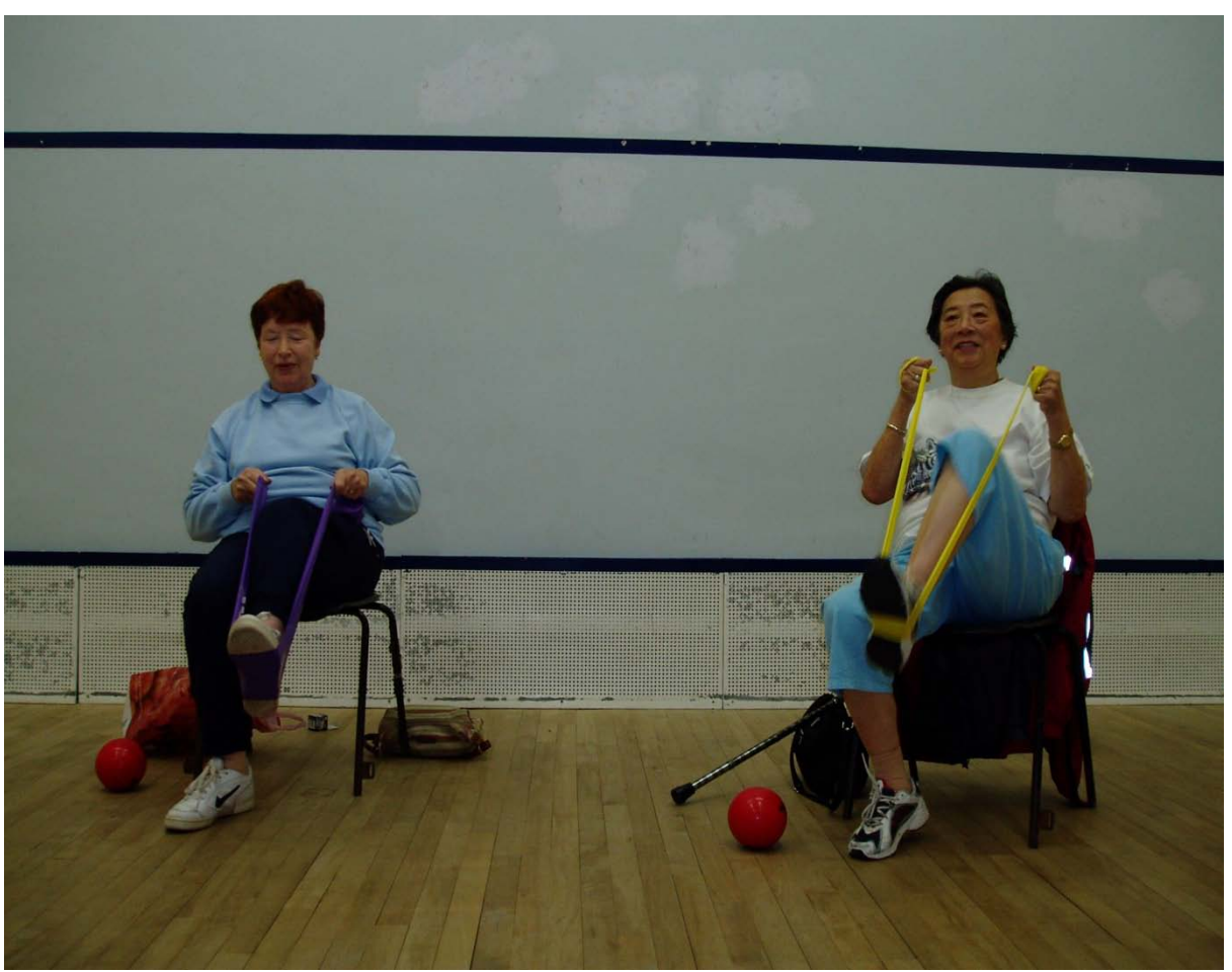
15. Chair based exercise class. 2008

A weekly chair based exercise group for older members of the community has now been running for the past three years. This has now been extended into other areas of the town and has become more sustainable following the training of three additional instructors who have been identified from within their own groups. New techniques are always being developed. Some groups now use new stretch bands for the classes. A further development has been the move towards extending the classes into 'Otago'. This is a standing up form of exercise used as a progression from chair based exercise. It increases strength, balance and co-ordination and increases the ability for individuals to carry out simple tasks such as standing from a chair without support, walking up stairs and reaching for items.