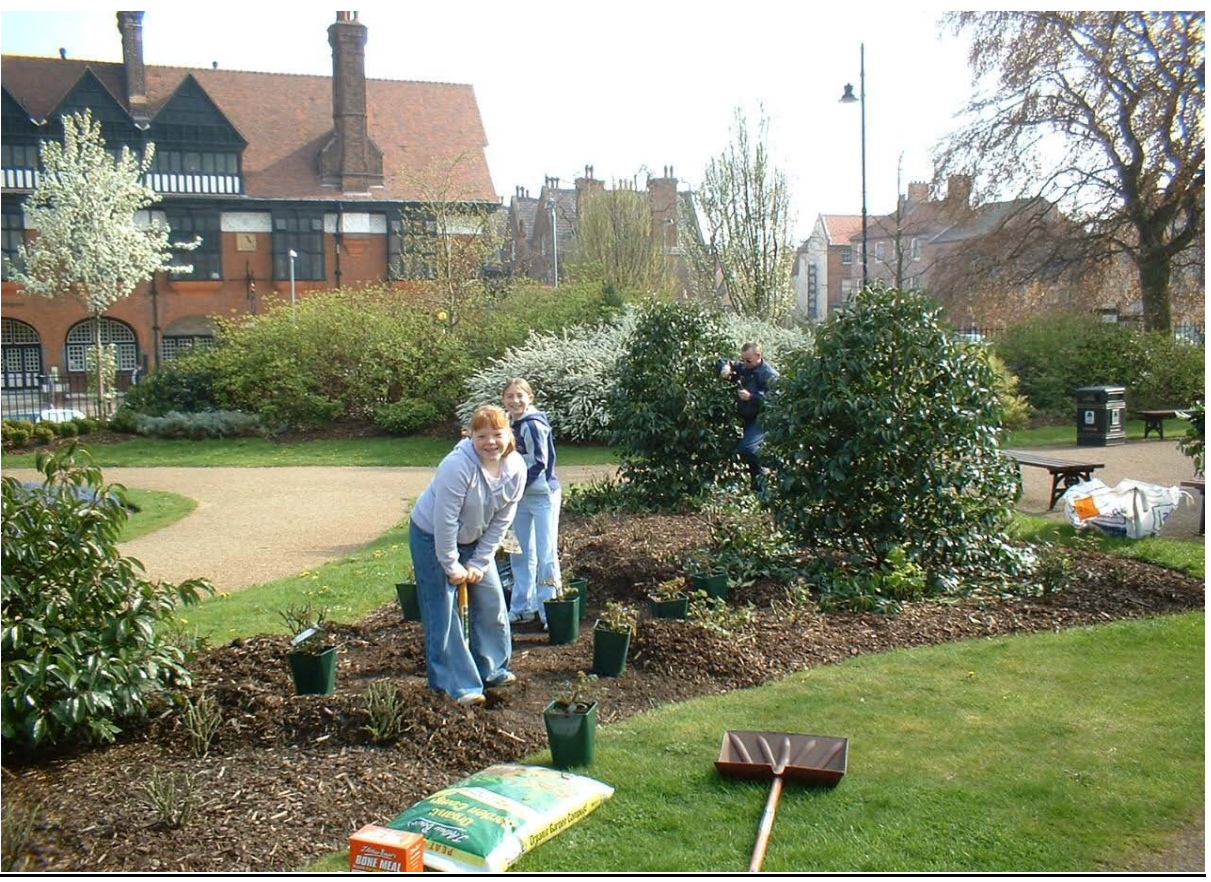
18. Volunteers on a planting day in Newark Castle grounds. 2007

Newark prides itself on involving all sectors of the local community, from any age group and from any area of the town, and it does this in many varied ways. The use of Friends groups are well established in Newark. Two of the local parks, the large town cemetery, the museum and the local theatre all have long established Friends groups that are active in funding raising, volunteering and maintaining the facilities for which they are so passionate.