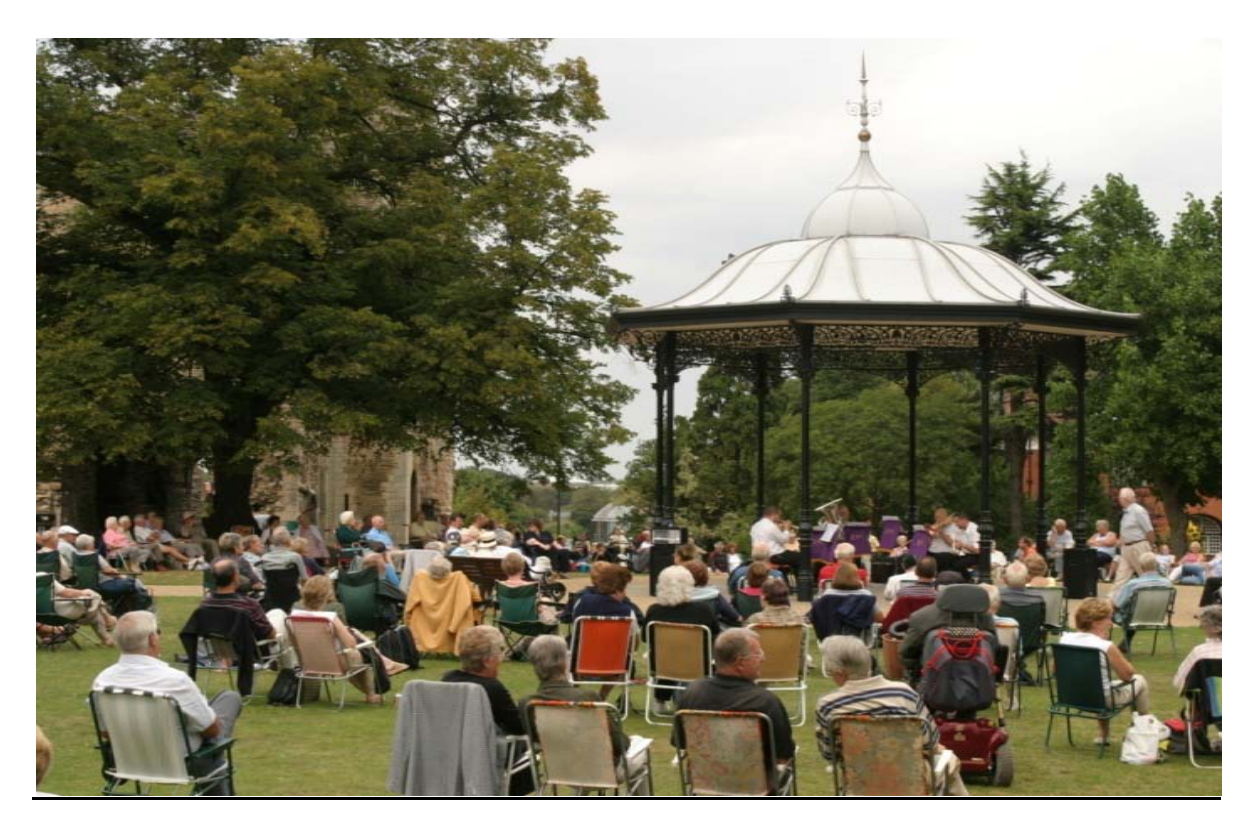
3. Event at Newark Castle. 2007

The Castle is now in the ownership of the District Council and a programme of improvements has allowed parts of the structure to be opened to the public. Over the past ten years a volunteer group 'The Friends of Newark Castle' has, with the help of the Council, raised and invested over £1 million pounds. Civil War re-enactments and guided tours take place around the Castle to allow the town's population to gain experience of the local heritage and history. In 2008 there were in excess of 25 community events centred around the Castle and its gardens.