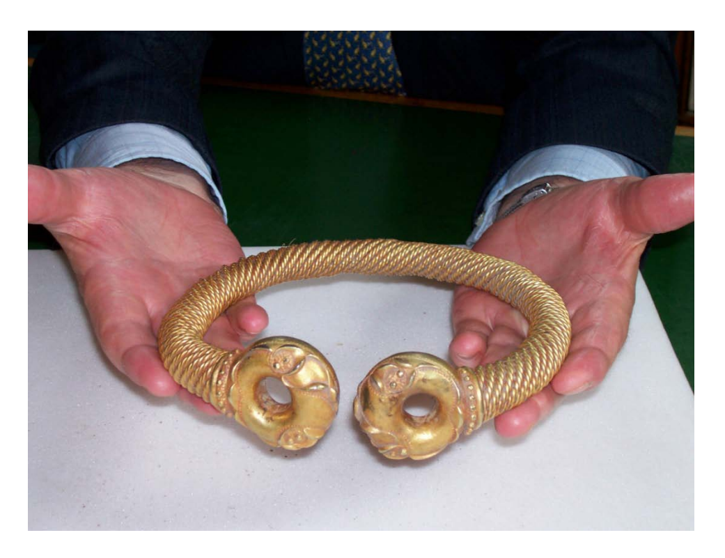
7. Newark Torc. 2007

Newark Millgate Museum, along with the Resource Centre and Gilstrap Centre, make up Newark and Sherwood Museum Service which has over 70,000 objects in its collections. The museum service runs a successful education and outreach programme, has a popular research/resource service and enjoys good community support via its partnerships, Friends group and volunteers.