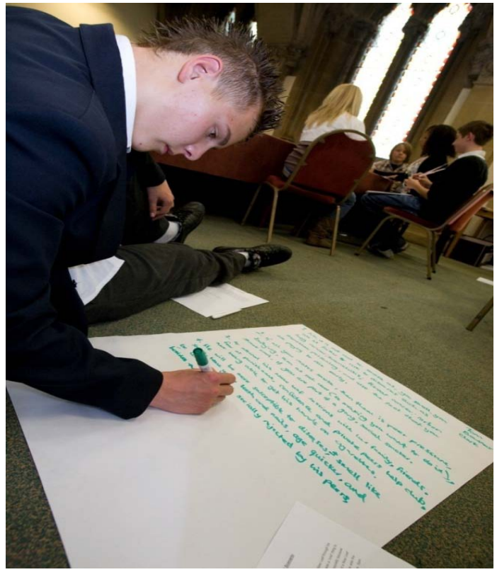
19. Youth Consultation event. 2008

There are community based Safer Neighbourhood Groups operating in Newark. The teams are made up of police officers, police community support officers, Neighbourhood Watch, housing officers, voluntary groups within the community and members of the public. These Groups are open to any members of the public to attend and raise issues impacting on their neighbourhoods.