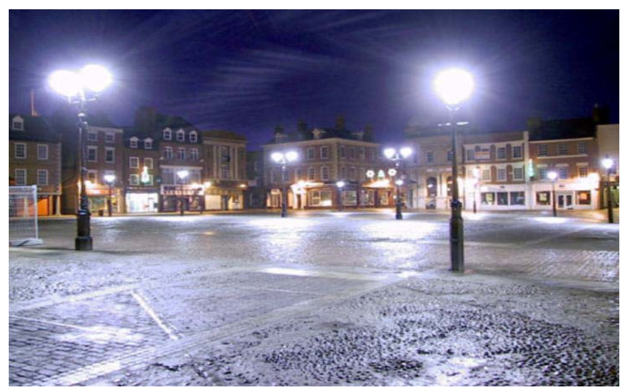
9. Newark market place by night. 2008