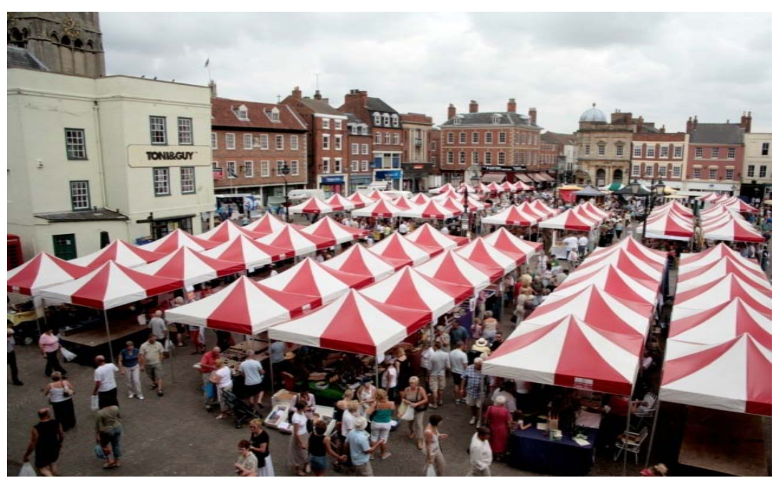
8. Newark market place by day. 2008

There have been changes to the physical environment, these have included replacing the uneven surface with granite sets, new lighting columns have been introduced and, most importantly, the market now has removable stalls that are only erected on market days. These changes have dramatically improved the environment of the market square and they have also allowed the square to be used as a centre for public participation events. Each year there is an increasing number of events that now take place in the market square. These include Newark Day (a celebration of Newark's past) and the annual Food Festival.