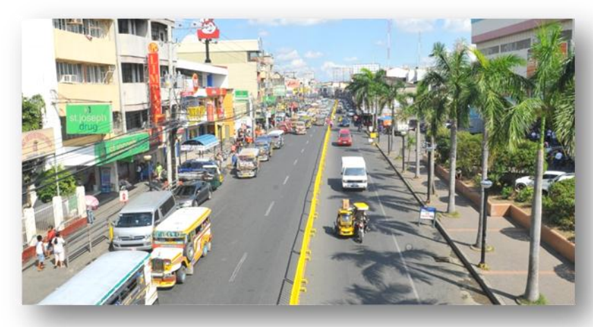
Central Business District of Dagupan City.

"We envision Dagupan City as the premiere center of the north for education, information technology, health, commerce and