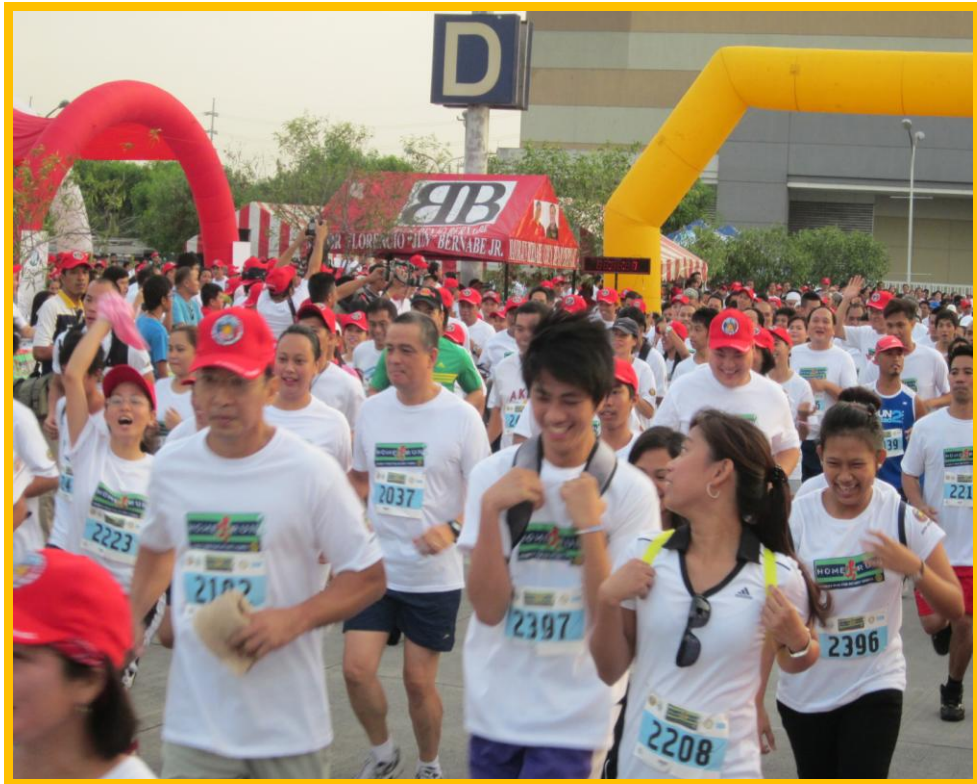
Home Run- Rotary Homes Project