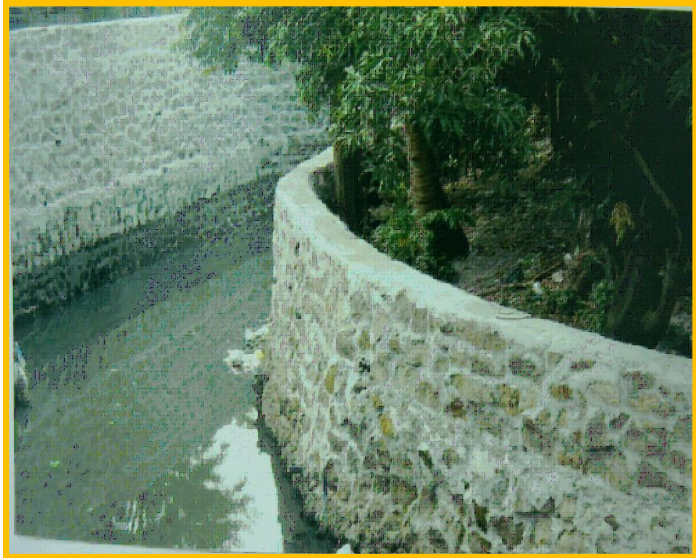
RIP RAPPING - BRGY. SAN ISIDRO