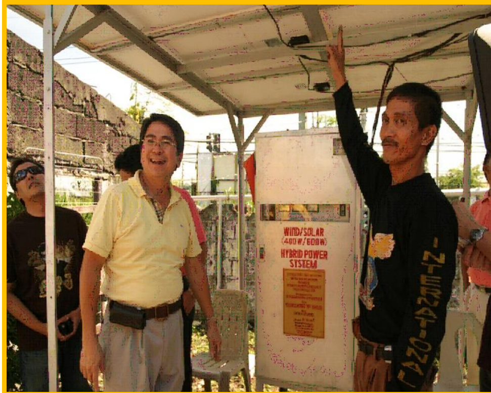
HYBRID POWER SYSTEM WIND/SOLAR - BRGY. BF HOMES