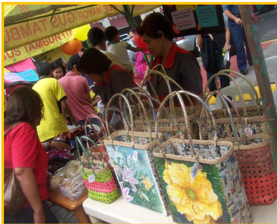
Livelihood projects – Recyclable materials