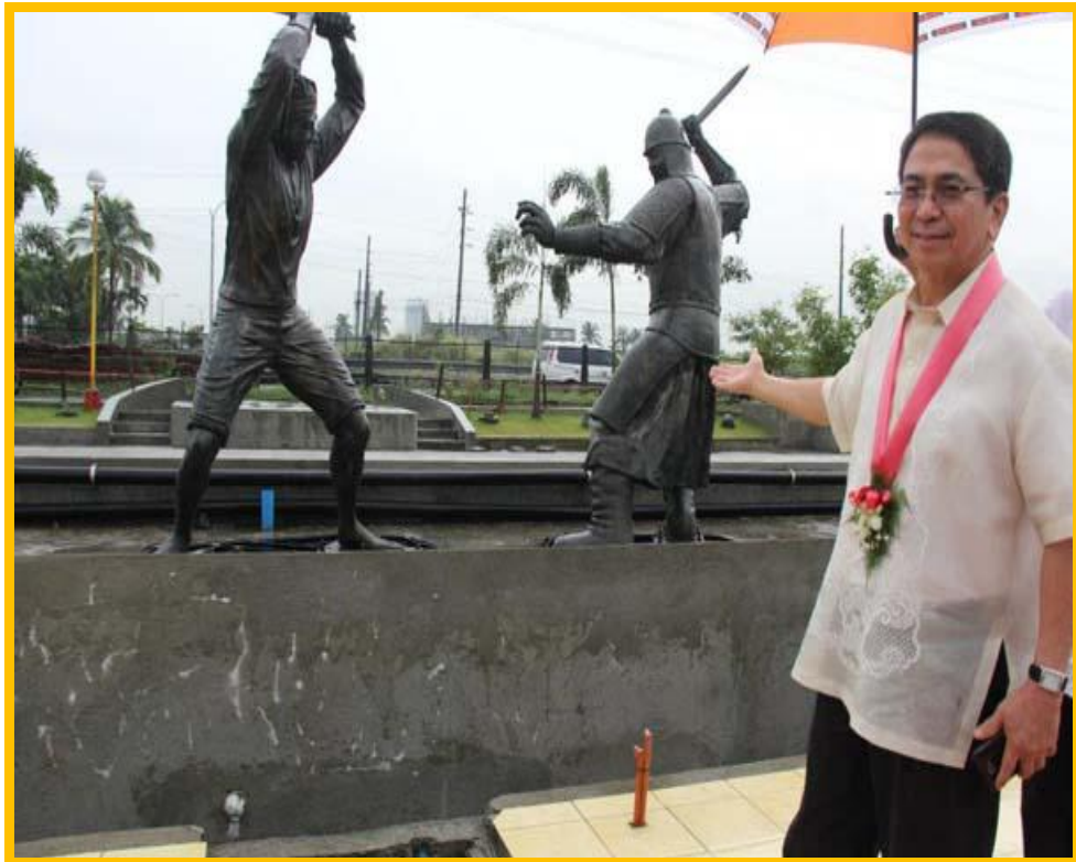
Don Galo Monument