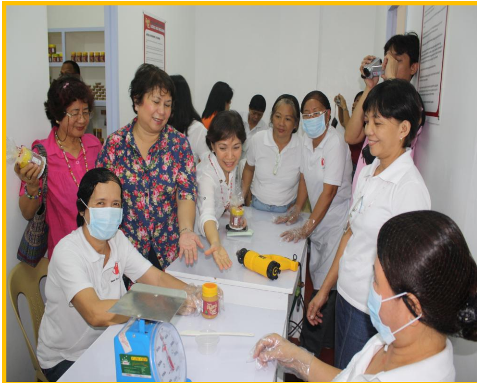
Livelihood projects –Mother's Best Peanut Butter Store