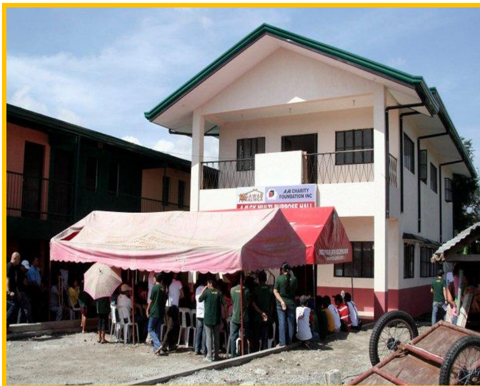
Socialized Housing Project