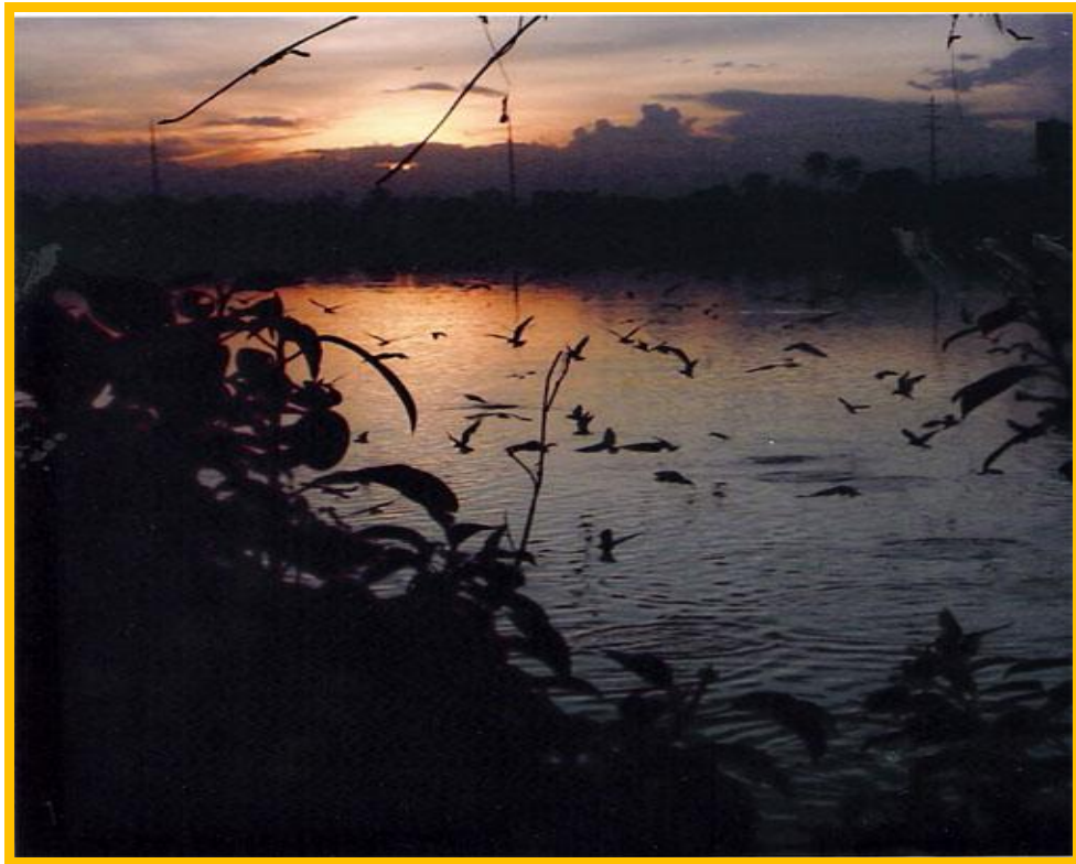
BIRD SANCTUARY- Home of Migratory Birds from Neighboring Asian Country such as China and as far as Siberia during Winter Season. Pick seasons from August to March.