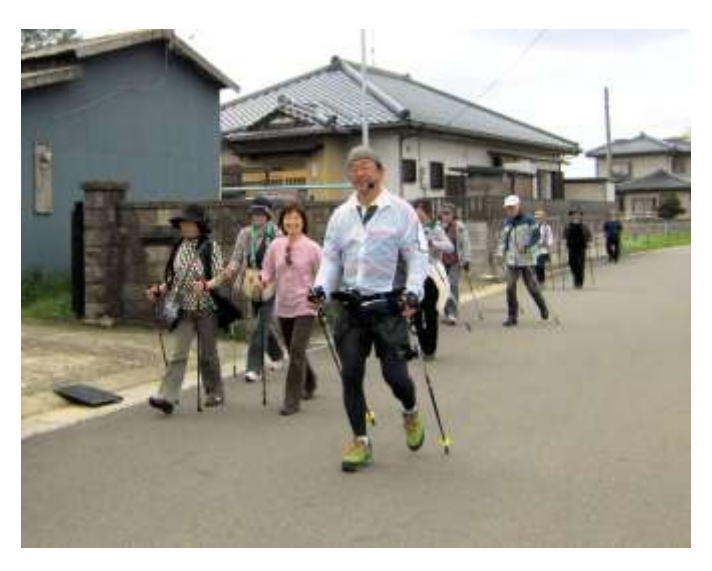
Practicing Nordic-walking for healthy life