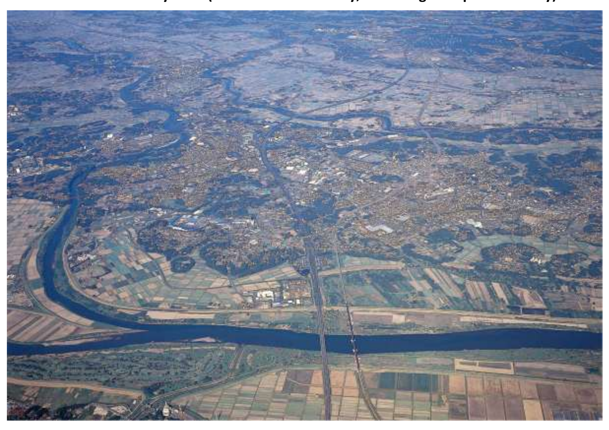
Photographs and Diagrams for reference Aerial View of whole City Area (center left: Motorway, center right: Express Railway)