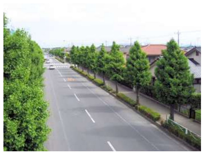
Landscape of street in planned residential area