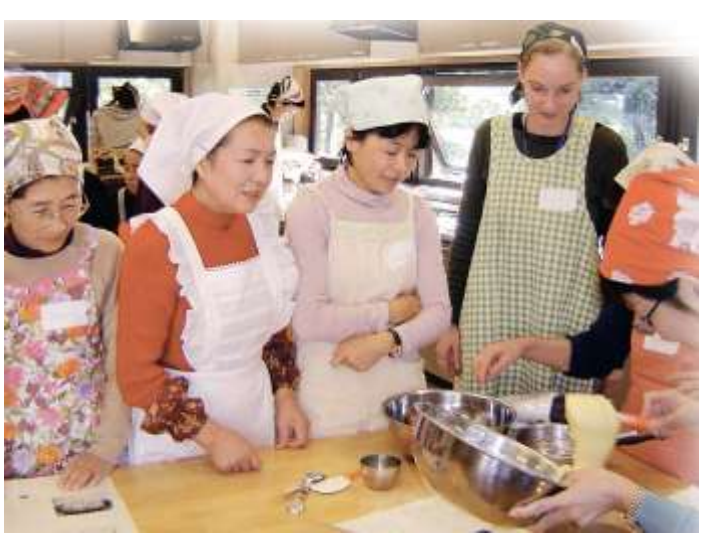
German cooking school with City's German International Communication Staff